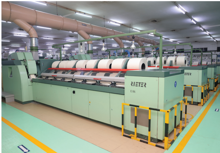
A view of new “Rieter E86” Comber Machine installed in our Unit at Rajapalayam.